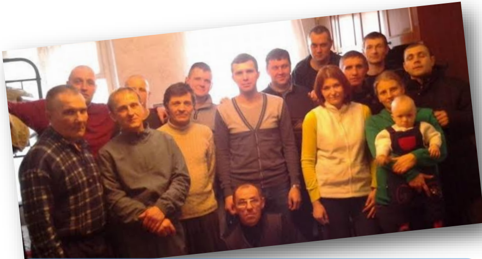
Residents at the rehab center with some of the regular members of the church who go there to help standing on the right