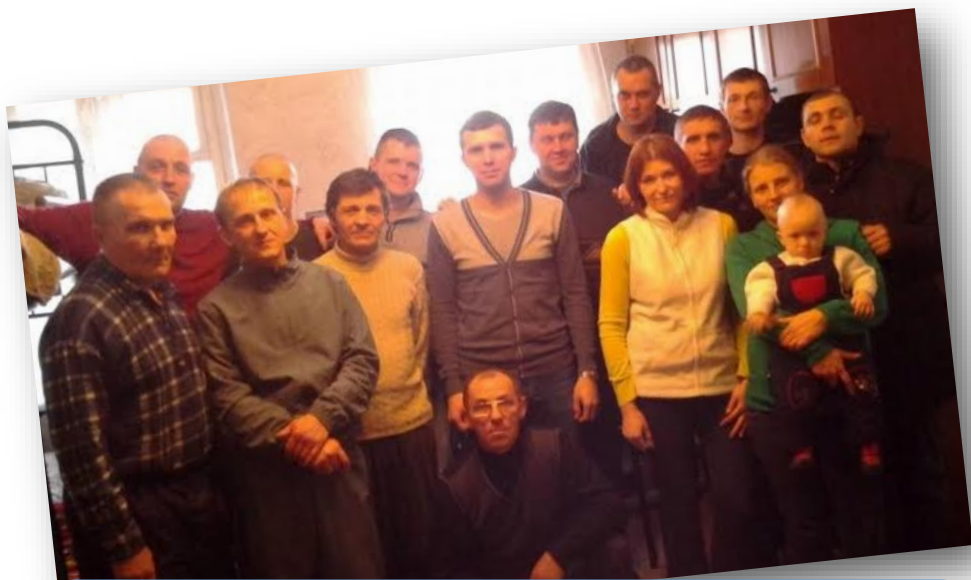
Residents at the rehab center with some of the regular members of the church who go there to help standing on the right

Recently, two members of the church have moved away from Nikopol: