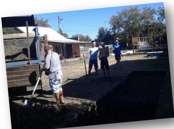
Beginning of the foundation for the new auditorium