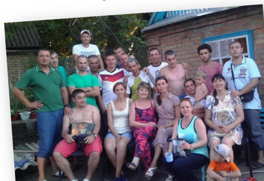
Some of the men at the Rehab center

The church in Ukraine finds itself in a difficult situation right now. They are trying to support a rehab facility which has been the backbone ministry for the church for two years. They also are supporting three men who minister diligently. It is amazing that they can do this on about $1200 per month. Unfortunately, in the year we have been back, support for the Nikopol church has waned. Though I no longer take a salary for the ministry, funds are still below budget. The economics of a war torn Ukraine simply do not allow the church to survive on the tithes and offerings of the members, which mainly cover the building, utilities, and some benevolence.