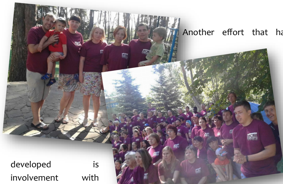
Camp "Govoree" ("Speak")