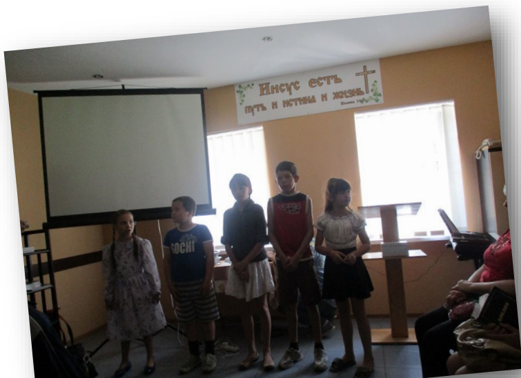
Some of the youth performing a special for the congregation