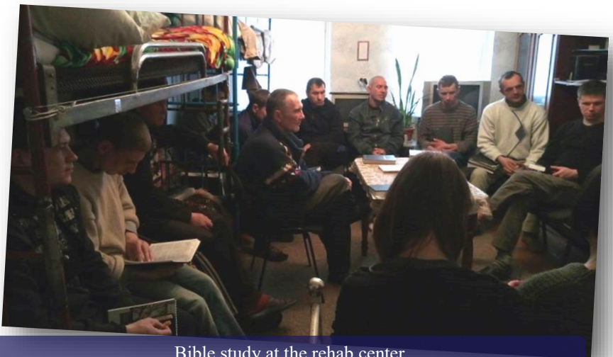
Bible study at the rehab center