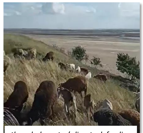
the rehab center's livestock feeding by the river. The visible beach is how far the water receded after the bombing of the dam.

God has kept the church safe through 2½ years of war and it has even thrived. It needs those who can, to help it continue through a period of transition. If you can contribute to this cause, please contact me.