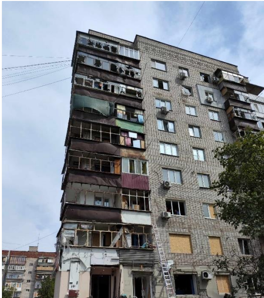
A bombed building near the center of town. I probably walked by this building 2-3 times a week.

In the recent months, attacks have been increasing in many places in Ukraine, especially along the front lines. Nikopol is considered the front, as it is directly across the river from one of the most heavily fortified parts of occupied territory. In 2023, Slavic and his family moved to a nearby village of Pokrovske. Now, even that has come under fire. Recently, there was an explosion 150 feet away from their home. Some months ago, a bomb hit the house diagonally across the street from the church building. This week several people were killed outside one of the shops we went to frequently.